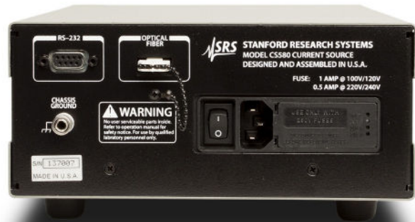
CS580 rear panel