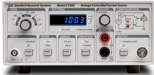
CS580 front panel

For remote interfacing with complete electrical isolation, the CS580 also has a rear-panel fiber optic interface. When connected to the SX199 Remote Computer Interface Unit, a path for controlling the CS580 via GPIB, Ethernet, and RS-232 is provided.