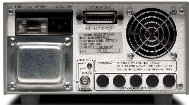
DG535 rear panel (with Opt. 02)