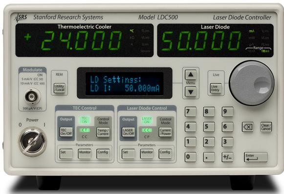
LDC500 front panel

The LDC500 series offers an auto-tuning feature which automatically optimizes the PID loop parameters of the controller. Of course, full manual control is provided too. Dynamic transfer between CT and CC modes for the TEC is also easy — just press the Temp/Current button.