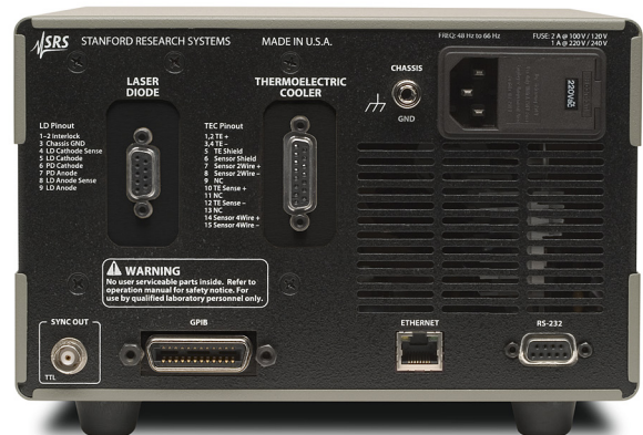
LDC501 rear panel