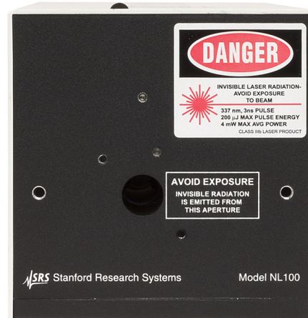
NL100 front panel