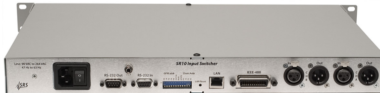
SR11 rear panel