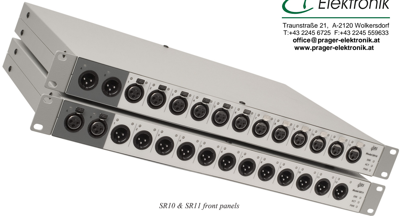
SR10 & SR11 front panels

Traunstraße 21, A-2120 Wolkersdorf T:+43 2245 6725 F:+43 2245 559633 office@prager-elektronik.at www.prager-elektronik.at