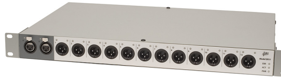
SR11 front panel