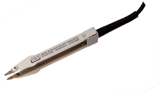
SR727 Surface Mount Tweezers

The SR715 and SR720 have a kelvin fixture which uses two wires to carry the test current and two independent wires to sense the voltage across the device under test. This prevents the voltage drop in the current carrying wires from affecting the voltage measurement. Radial components are simply inserted into the test fixture, one lead in each side. Axial devices require the use of the axial fixture adapters (provided). Surface-mount devices, or components with large or unusually shaped leads, can be measured with optional SMD Tweezers (SR727) or Kelvin Clips (SR726). The tweezers and clips attach directly to the LCR meter's front-panel test fixture. An optional BNC Fixture Adapter (SR728) allows you to connect a remote fixture or other equipment through one meter of coaxial cable.