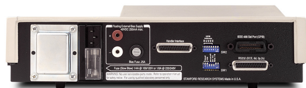
SR720 rear panel

Two rear-panel input connections are provided for an external bias voltage. Voltages as high as 40 VDC can be used. An optional handler interface provides control lines to a component handler for sorting. A standard RS-232 interface allows complete control of all instrument functions by a remote computer. A GPIB interface is included with the handler option.