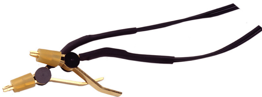
SR726 Kelvin Clips

The SR715 and SR720 support three types of binning schemes: pass/fail, overlapping and sequential. Pass/fail has only two bins: good parts and everything else. Overlapping (or nested) bins have one nominal value and are sorted into progressively larger bins (e.g., \pm 1\% , \pm 2\% , \pm 3\% ). Sequential